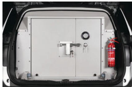
Cash Box w/ Double Locking System