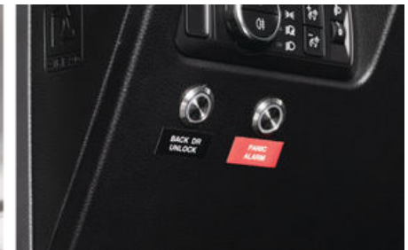
Panic Alarm & Rear Door Locking Switch

Notes: The company reserves the right to change the vehicle specifications and features described in this publication at any time. Vehicle specifications and features may vary in different markets. Images are for illustrative purposes only and may appear different from the actual vehicle. Some Features Shown Are Optional.