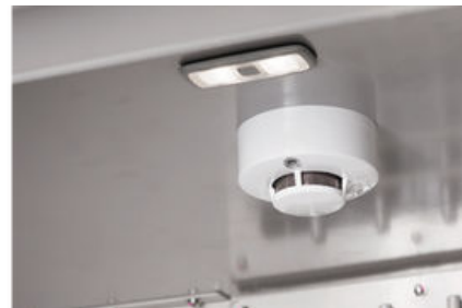
Dome Light and Smoke Detector