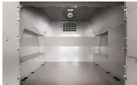
Cash Box Interior