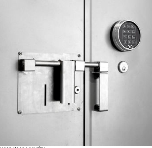
Rear Door Security