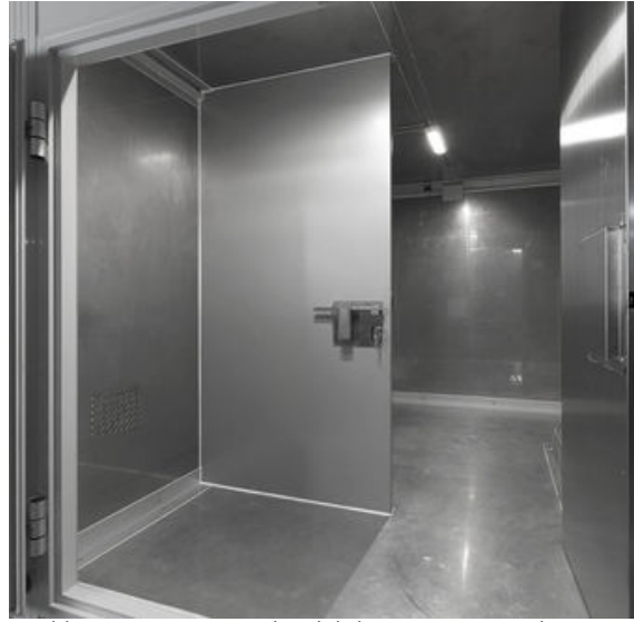
Double Door System Interior Lighting w/ Door Function