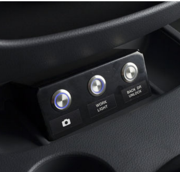
Control Panel For Locking & Lighting System

Notes: The company reserves the right to change the vehicle specifications and features described in this publication at any time. Vehicle specifications and features may vary in different markets. Images are for illustrative purposes only and may appear different from the actual vehicle. Some Features Shown Are Optional.