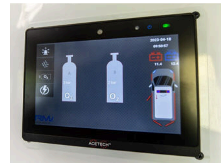
Digital Touchscreen Patient Compartment Control Board