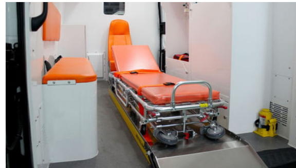
Main Stretcher and Stretcher Ramp