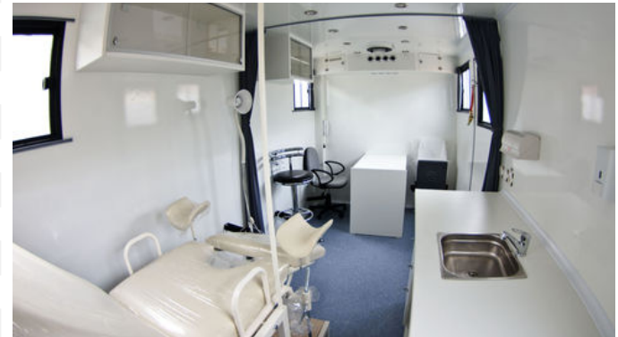
Patient Bed & Wash Basin