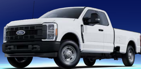
F-250 Super Cab, SRW