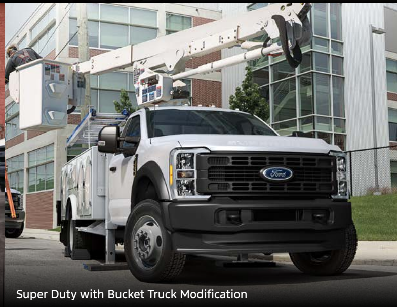
Super Duty with Bucket Truck Modification