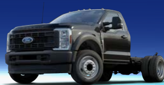
F-550 Chassis Cab, DRW