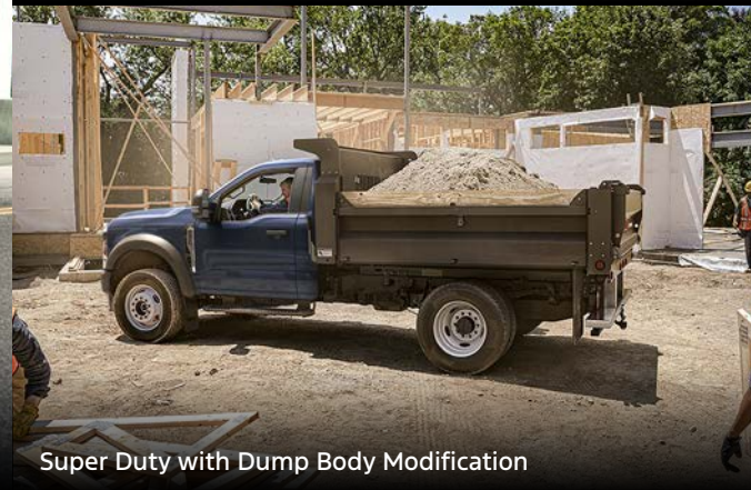
Super Duty with Dump Body Modification