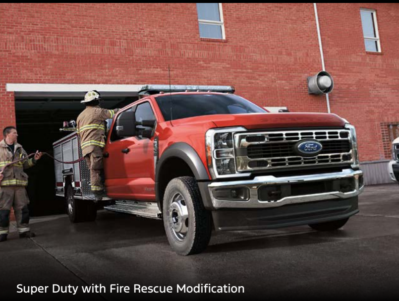
Super Duty with Fire Rescue Modification