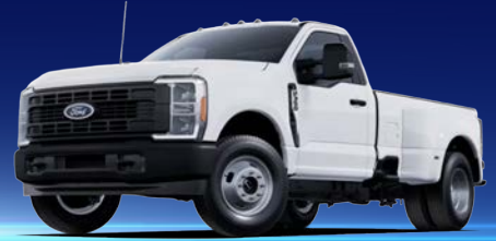
F-350 Regular Cab, DRW