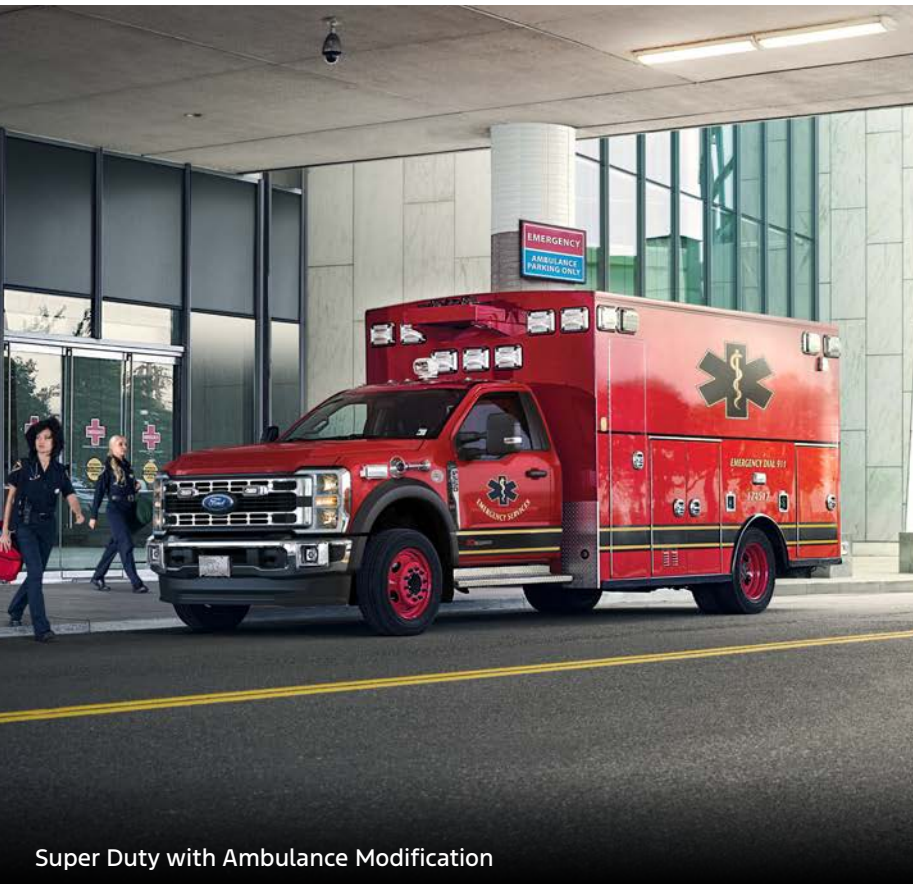
Super Duty with Ambulance Modification