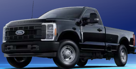
F-250 Regular Cab, SRW

The pinnacle of heavy-duty trucks with the Ford Super Duty® offers the best-in-class towing capabilities, payload and horsepower. This reliable Super Duty® trucks provide thoughtfully crafted details that go beyond their rugged demeanor. Enjoy useful cabin conveniences that help maximize comfort and productivity during long days on the road.