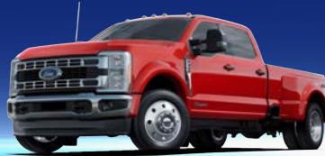
F-450 Crew Cab, DRW