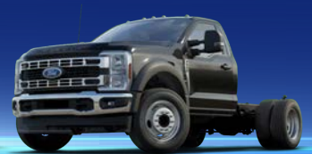
F-600 Chassis Cab, DRW