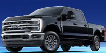
F-350 Crew Cab, SRW